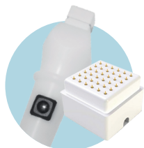
RF Micro-aiguilles jetables Disposable Microneedles