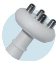
RF Quadripolaire Quadropolar