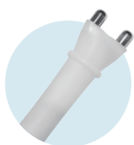
RF Bipolaire Bipolar